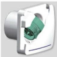
Centrifugal forward curved impeller

Centrifugal forward curved impeller, with an extremely low sound level.