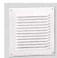
GRA-70 Aluminium grille.