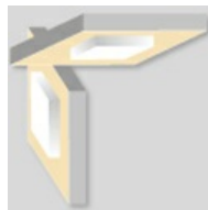
Wall or ceiling installation

Motor mounted on "Silentelastical- block" to prevent vibration and noise transmission.