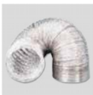
GSA-100 Flexible aluminium ducting.