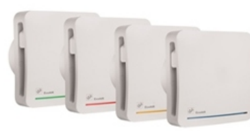
Different styles with the bars colours