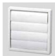
PER-100W Back draft shutter.